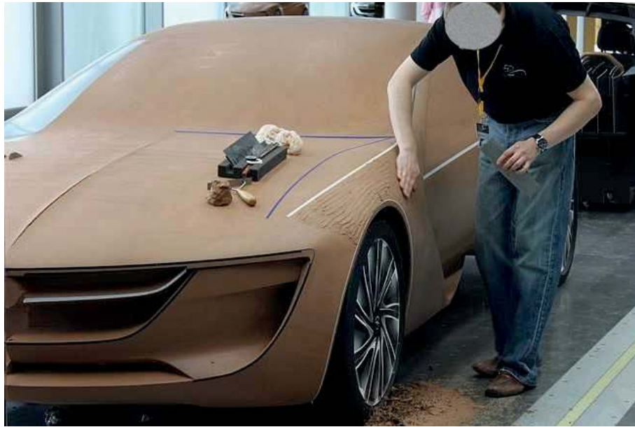
Figure 3: The use of a full-sized clay model