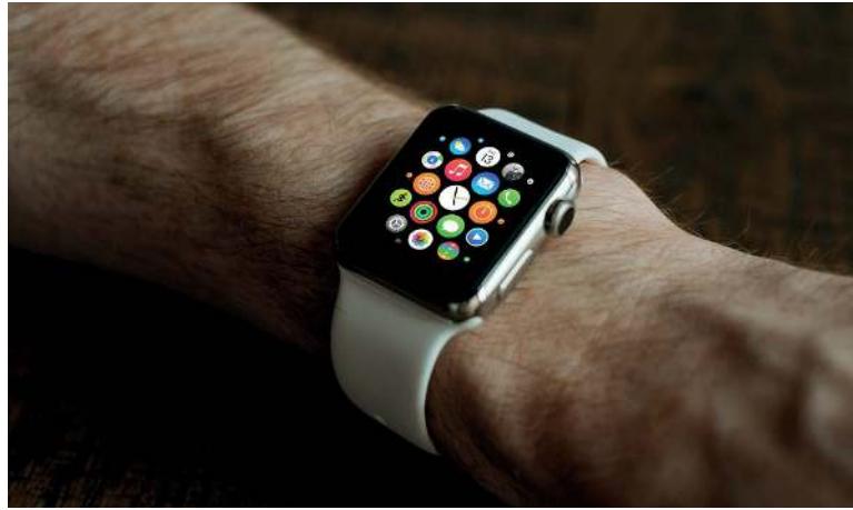
Figure 8: A smartwatch