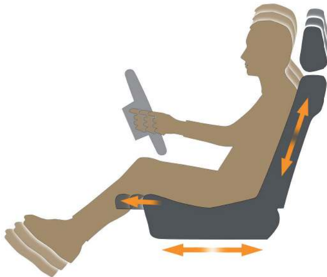
Figure 2: 2D graphics of the ergonomics of an interior