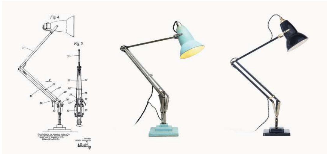
Figure 5: The Anglepoise lamp