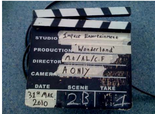
Figure 4: A traditional clapperboard