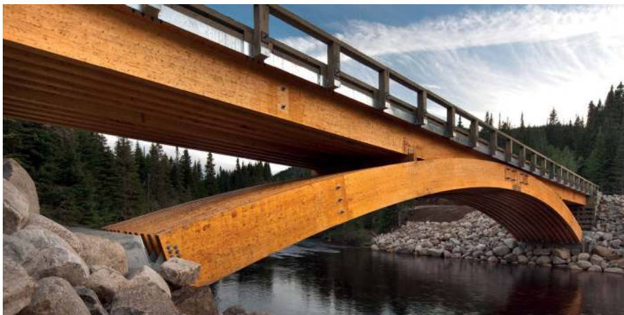
Figure 7: A timber bridge

In other cases, bridge designers have used traditional materials such as wood. Figure 7 shows a timber bridge in Canada.