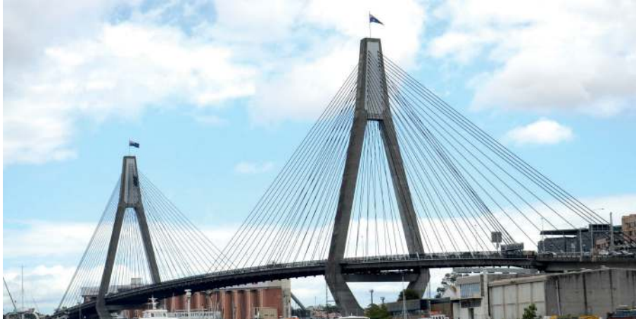
Figure 6: The Anzac Bridge