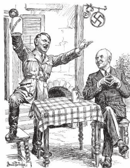
PROSIT! HERR HITLER: "THE MORE WE ARM TOGETHER THE PEACEFULLER WE'LL BE!" SIR JOHN SIMON: "WELL—ER—UP TO A CERTAIN POINT—AND IN CERTAIN CASES— PROVISIONALLY—PERHAPS."

Herr Hitler: "The more we arm together the peacefuller [more peaceful] we'll be!" Sir John Simon: "Well—er—up to a certain point—and in certain cases— provisionally—perhaps."